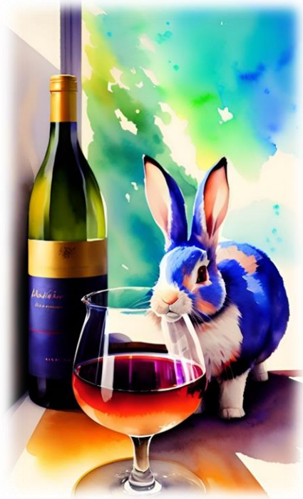
(Chardonnay, Cuvee De Oro, Tempranillo, Vigna

SGYC’s National Drink Wine Day Event could not have been more perfect! In addition to the fantastic wine presented from local winery Monte De Oro/Temecula, the Italian charcuterie table was 12ft long and delighted every palate! The three charcuterie boards & bread baskets were provided by Cortina’s Italian Deli & Market. The boards did not have just fresh Italian meats and cheeses, there was also organic honey, nuts and varying dried & fresh fruits with beautiful orchids just to make them even prettier. They were almost too pretty to eat!