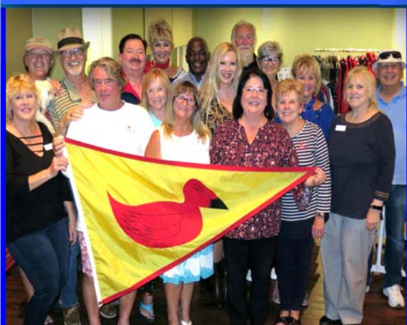
ANNUAL MEMBERSHIP MEETING 2019 & 2020 BOARD OF DIRECTORS