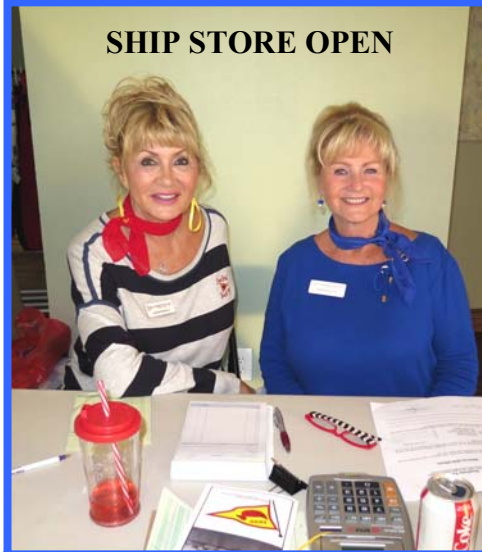
SHIP STORE OPEN