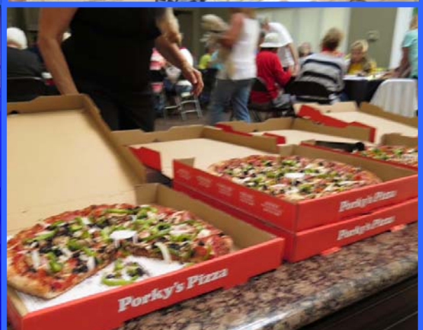
FOOD FOR ALL AT THE 2019 ANNUAL MEMBERSHIP MEETING