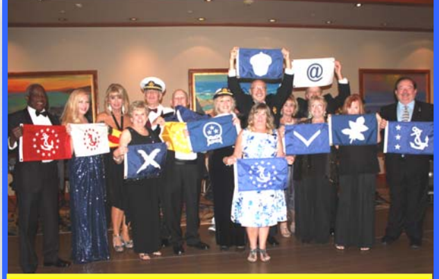
Newly sworn 2019 SGYC Board of Directors