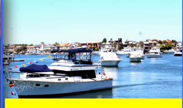
SGYC PARADE OF BOATS