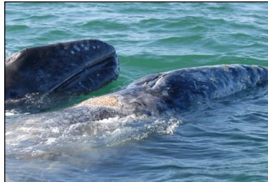
Mother and baby (on left)