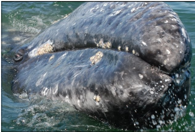
A mother whale saying hello

From March 3 to March 10 several of our members (pictured below) traveled south down the Baja peninsula to San Ignacio Lagoon, reportedly the only place in the world where whales approach humans. The pictures speak for themselves. Everyone saw, touched and interacted with these magnificent, and as it turns out, friendly giants. It was an experience of a lifetime, unlike anything I have ever experienced.