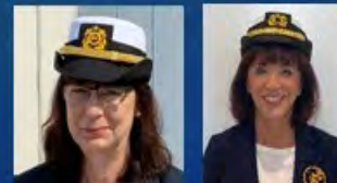
New Year's Eve Party