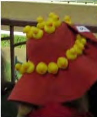
THIRD PLACE ASCOT HAT CONTEST WINER

2021 NIGHT AT THE RACES LOS ALAMITOS MEMBER AND GUEST