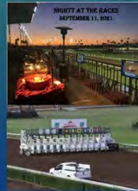
Night at the Races 1 st group event allowed At Los Alamitos in 18 months