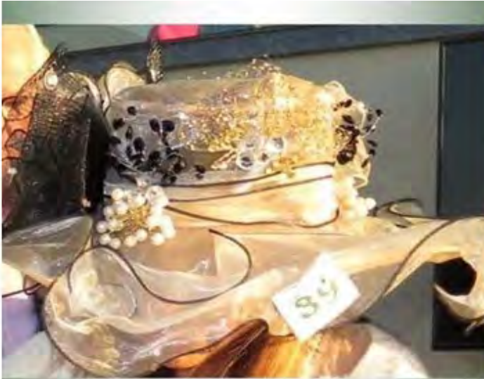
FIRST PLACE ASCOT HAT CONTEST WINER