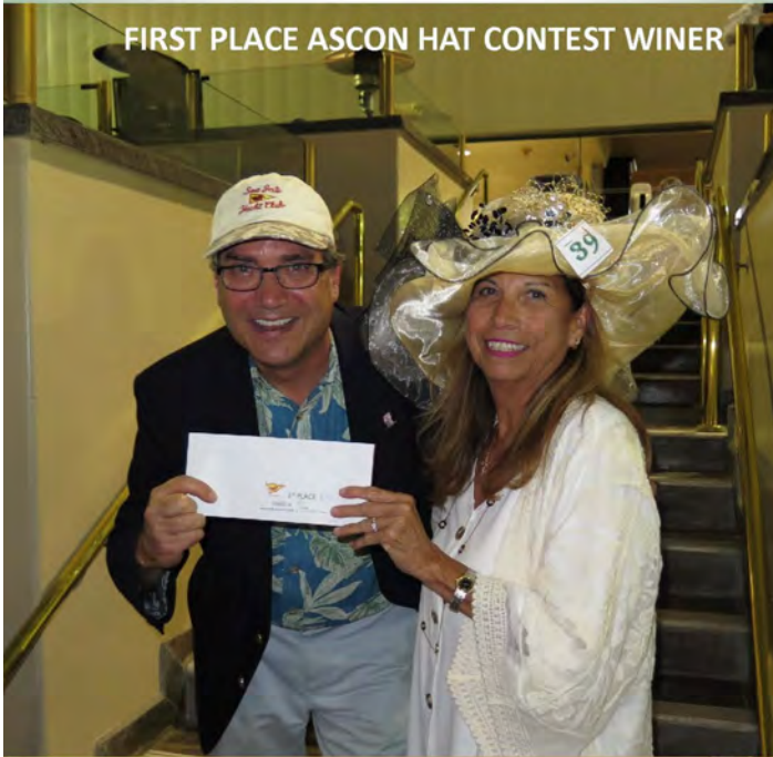
FIRST PLACE ASCON HAT CONTEST WINNER