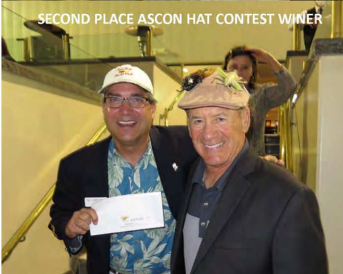
SECOND PLACE ASCON HAT CONTEST WINNER