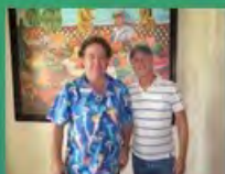
NEW MEMBERS BRUNCH