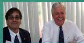
BAHIA CORINTHIAN NIGHT DINNER