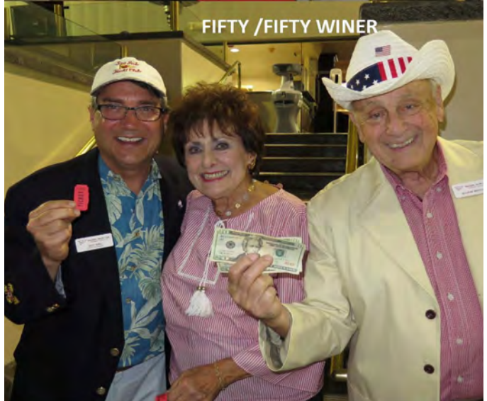
FIFTY /FIFTY WINER