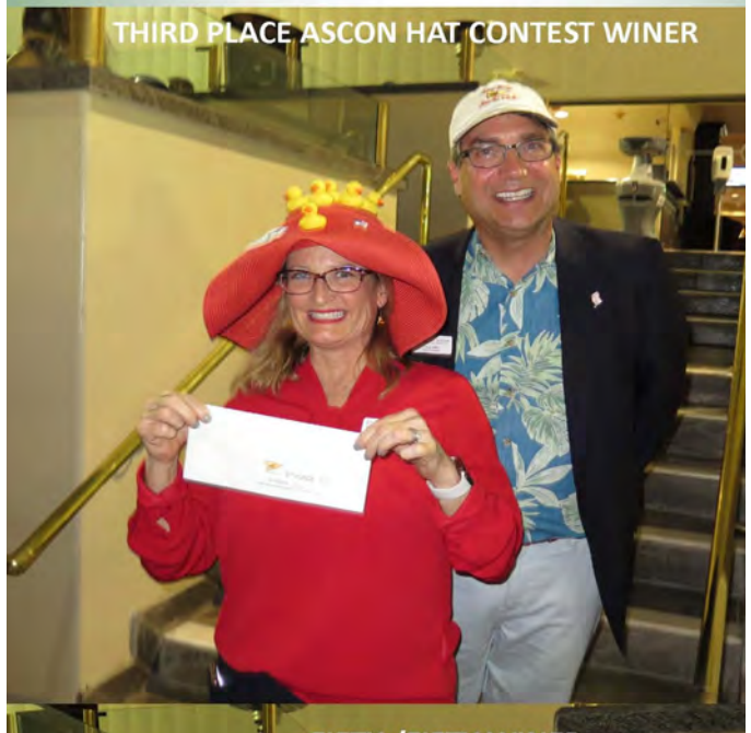
THIRD PLACE ASCON HAT CONTEST WINNER