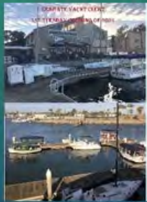
1 st Tuesday Cruising At Huntington Harbor