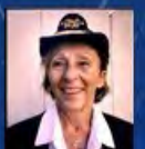
Vice Commodore PRESENTER