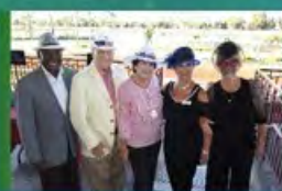
Night at the Races