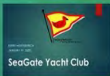
EVENT HOST BRUNCH