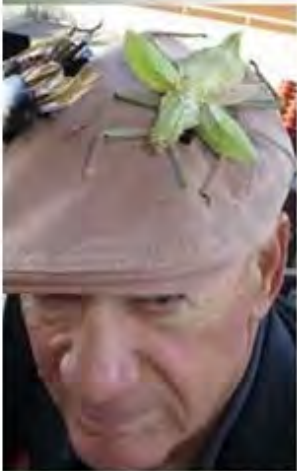
SECOND PLACE ASCOT HAT WINER