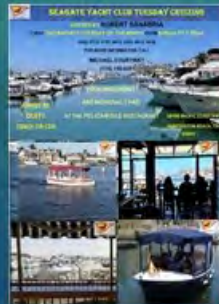
Tuesday Cruising At Pelican