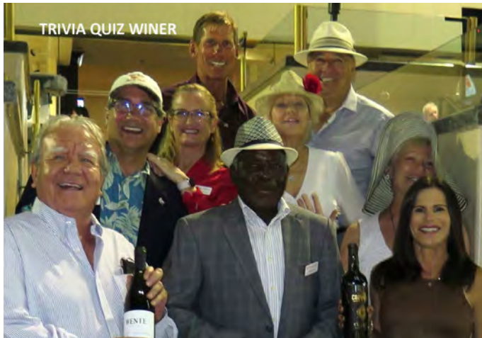
TRIVIA QUIZ WINER