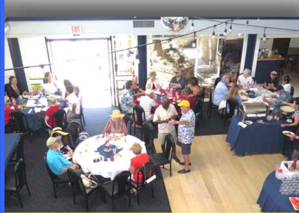
HUNTINGTON HARBOUR SUNDAY BRUNCH