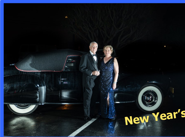
New Year's Eve pg. 4-5