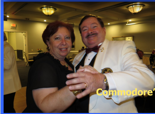
Commodore's Ball pg. 2