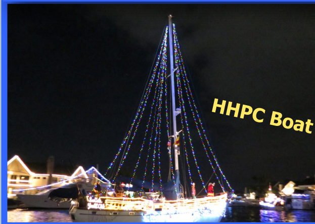
HHPC Boat Parade pg. 3