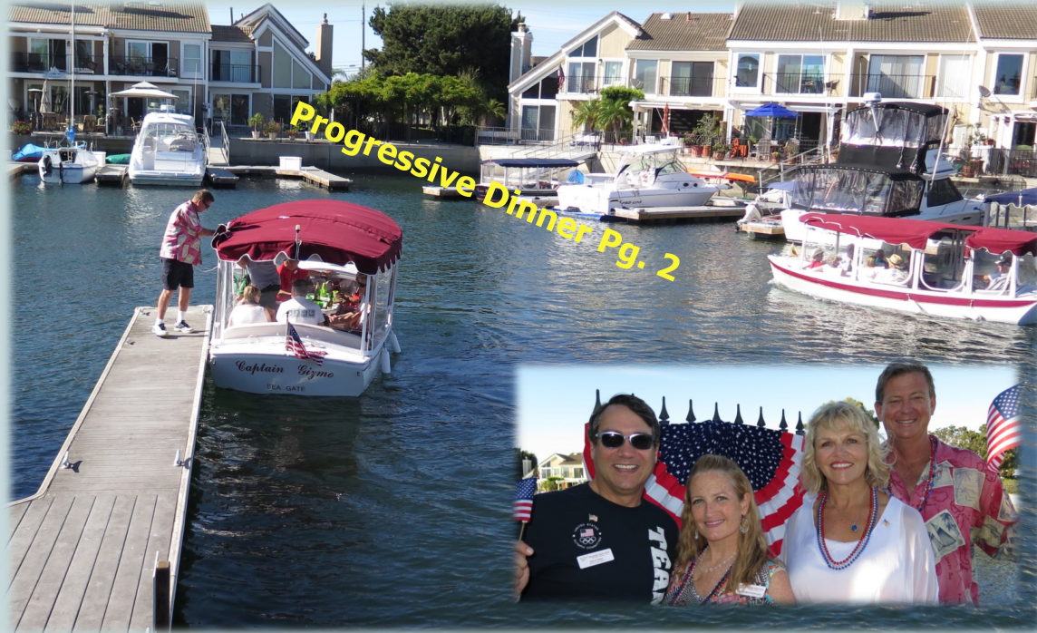
Progressive Dinner Pg. 2